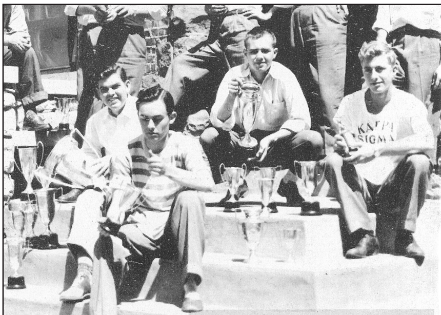
Gamma-O Brothers from the late 1940s

"Not for an hour ...a day ...or college term only ...but for life"